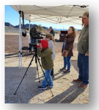
Is that a Dinosaur??

Over 15 youth at a time received instruction and were able to shoot recurve and compound bows. Some youth enjoyed the archery so much, they didn't put down their bows until lunch time.