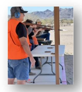
Competing for the Canyon Cooler tumbler

When all the ladies had completed their time at the