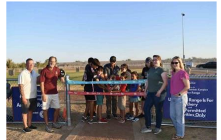
Ribbon cutting ceremony for new archery range located at the PAAC in Yuma.

On October 5 th , Yuma Parks and Recreation opened a much-anticipated new archery range at the Pacific Avenue Athletic Complex located at 1700 E 8th St. in Yuma. The construction of the new range