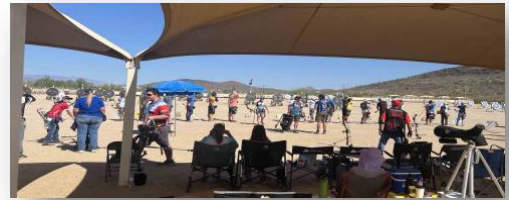
ABFAA State International Championship participants preparing for competition.