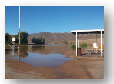
Right: Covered picnic area next to entrance to the range.

For those brave souls who still want to shoot and don't mind muddy boots, the Canyon Course will be open for 3D shooting on Sundays until everything else dries out. Please check the website's Home Page and Calendar often for updates!