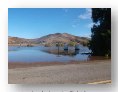
Another look at the Field Range from Adair Park Road.