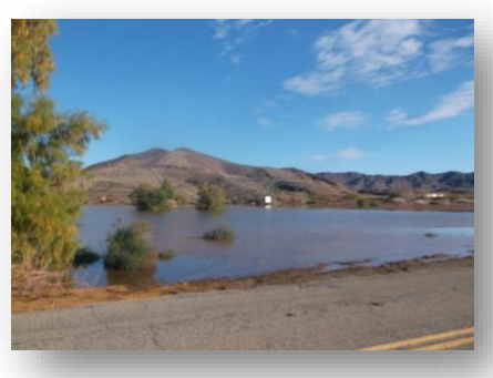
Looking at the Field Range from Adair Park