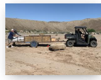
Balancing act - moving bales

Now there are two sides to the range, both with bales at 20, 30, 40, 50 and 60 yards. The south half of the range still has a 70-