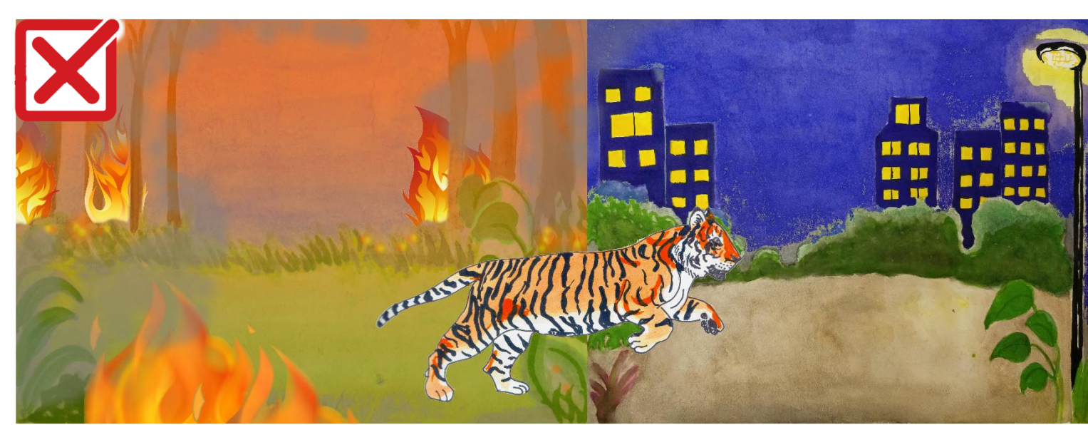
DO NOT Hunt the Tiger's Prey – or the Tigers Will Hunt Your Cattle