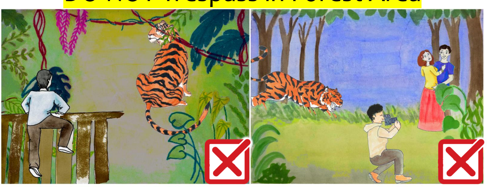
DO NOT Trespass in Forest Area