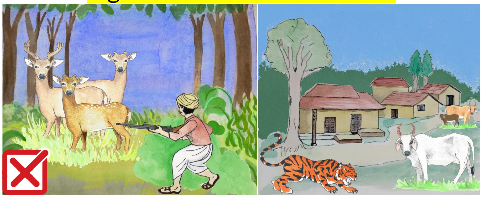
Bhopal Landscape is the Only City Landscape Where Humans & Tigers Coexist With Least Conflict