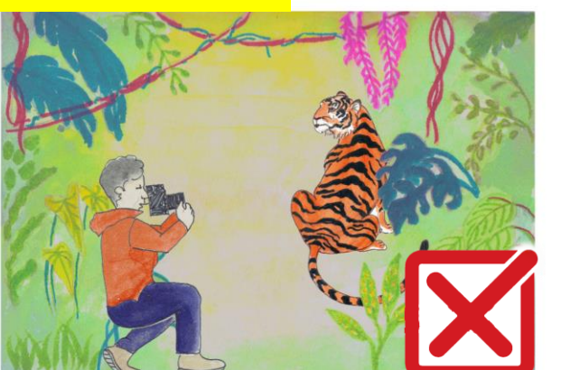
DO NOT Go Near the Tiger – Walk Away & DO NOT Try to Photograph it