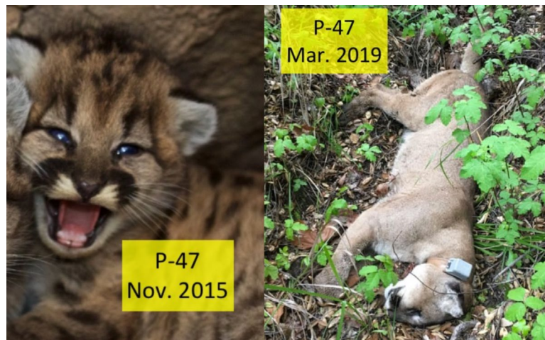
Figure 2. Testing of P-47's liver tissue by the California Animal Health and Food Safety Lab revealed that the 3-year-old male had been exposed to six different anticoagulant compounds and died of internal hemorrhaging in his head and lungs in March 2019.