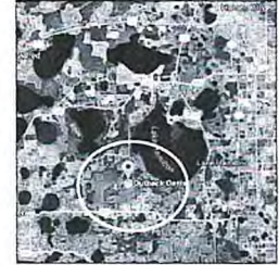
LOCATION MAP SCALE