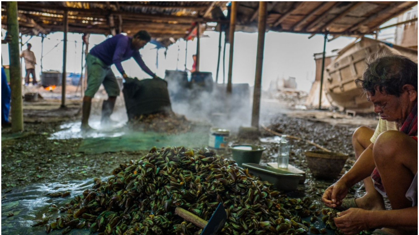
Muara Angke, Indonesia: Workers steam and shuck mussels pulled from the waters around Jakarta, Indonesia. Scientists have studied how micro plastics absorb toxins they are in proximity too and how they are then taken up into the food chain in mussels and other shellfish.