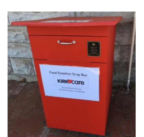
Kirk Care Drop Box

First Community in Kirkwood hosted a food drive