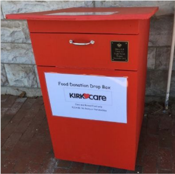
Kirk Care Drop Box

Kirkwood library, Kirkwood Community Center, Kirkwood City Hall and Kirkwood train station. If you have a local business willing to house a red box please contact Kirk Care.