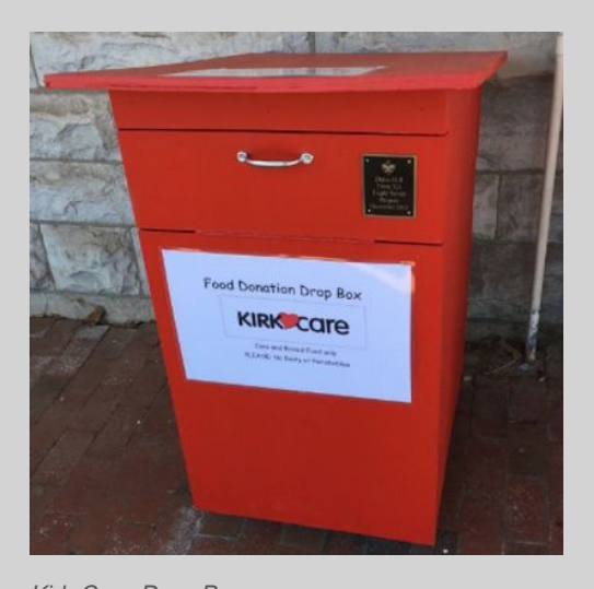
Kirk Care Drop Box

they can do with a guardian's help or on their own. The KPL will partner with Kirk Care to deliver packets to our clients with children over the summer months