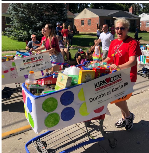
Cheering on the crowd

Kirk Care had their booth again at spot number 6, where they got a great amount of traffic. Volunteers for Kirk Care manned the booth the entire