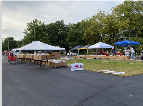
Food drive at Kirkwood Methodist Church

people 42% were children. Kirk Care continues to support area food drives to meet the needs of our community.