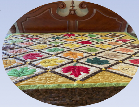
"FALLING LEAVES" COMPLETED BY MARIAN ROSE