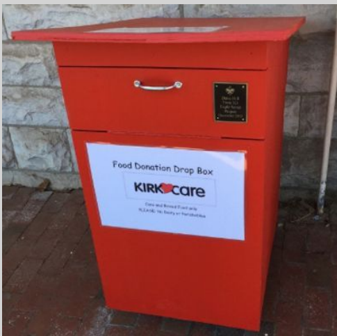
Kirk Care Drop Box