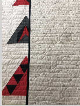
Back of Equilateral Sampler