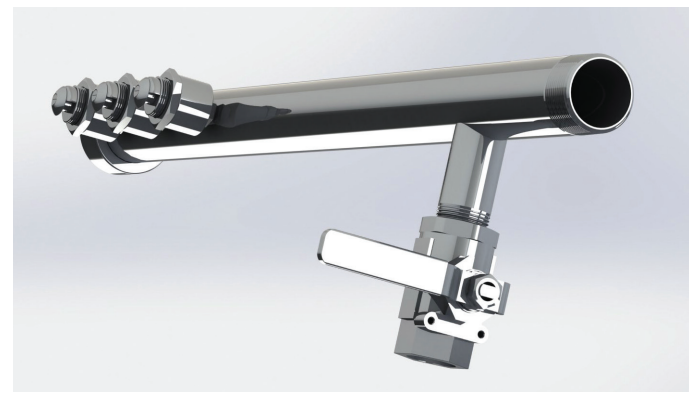
Trim knock-off conversion from quarter NPT to spring purge nozzles.

Once the spring purge adapter and nozzles have been installed, the shower header is then typically rotated to accommodate the non-perpendicular spray from the centerline of the shower header. The new spring purge nozzles transform the once 'pain in the neck' shower to something that, with an automated AutoPurge<sup>TM</sup> valve, can be a 'set it and forget it' solution.