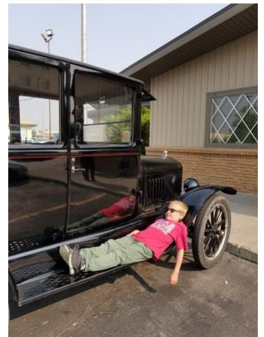
Atom Eagle taking a break during the Garage Tour