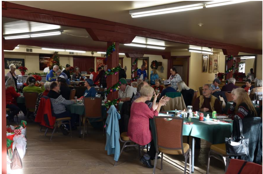
Christmas Party 2021 – Happy New Year!