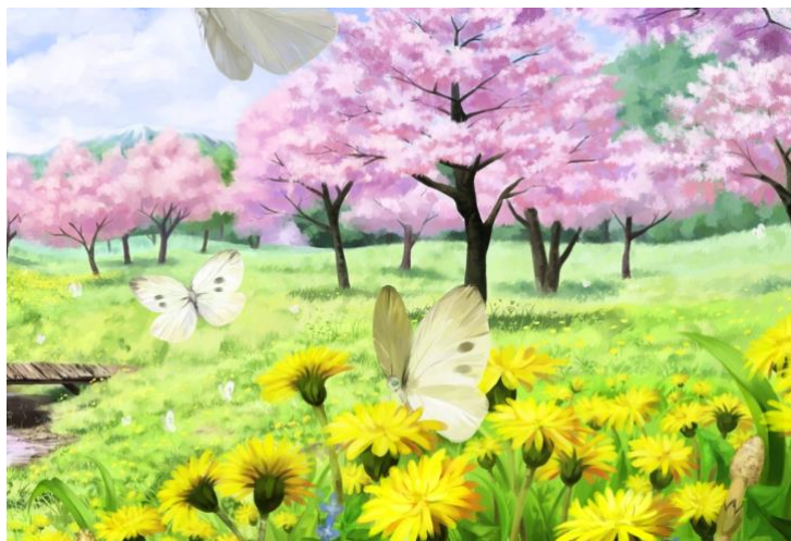
Come on Spring!