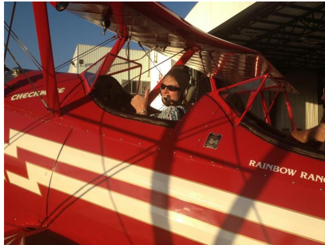
Stearman Biplane Ride