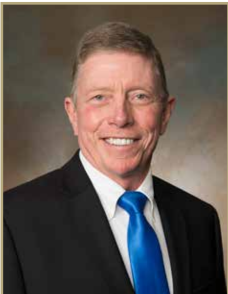
Col. Michael E. Fossum Chief Operating Officer (TAMUG) and Vice President (TAMU)

Welcome to the Shared Quarters National Maritime Workforce Conference! We are excited to welcome you to the Texas Gulf Coast for this prestigious conference.