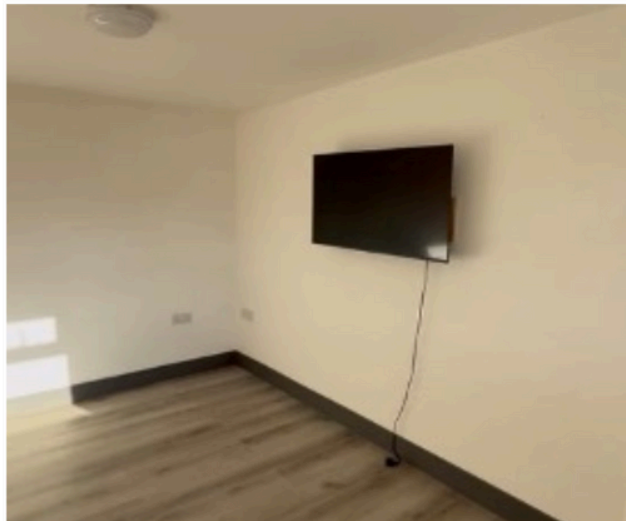
COMMUNAL AREA WITH TV