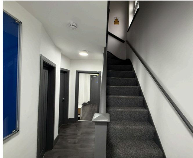
WALKWAY & STAIRCASE