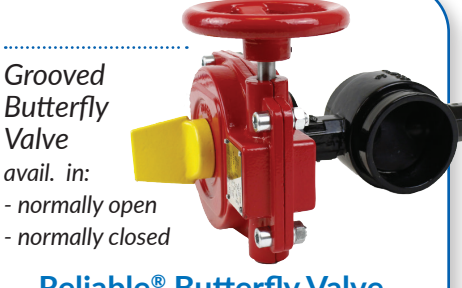
Reliable® Butterfly Valve