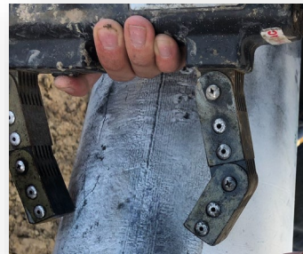
Magnetic Particle Inspection

Our experienced technicians will then evaluate the indication to assess the location, size, shape and extent of these imperfections.