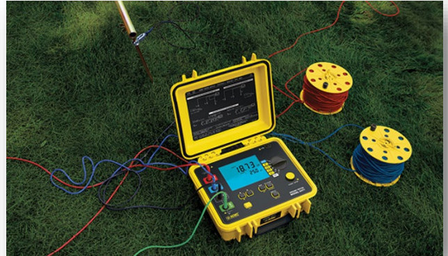
Soil Resistivity Measurement

From corrosion engineering perspective, the lower the resistivity, the higher the corrosivity and vice versa. The Wenner method requires the use of four metal probes or electrodes, driven into the ground along a straight line, equidistant from each other. Soil resistivity measures are derived from the voltage drop between the center pair of pins, with current flowing between the two outside pins.