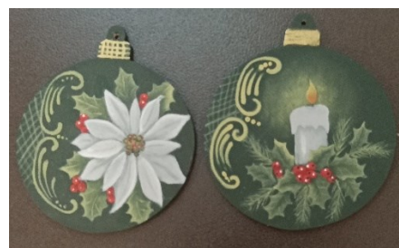
Poinsettia and Candle ornament Peggy Thomas January 2025