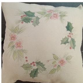
Holly on Pillow Peggy Thomas September