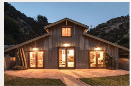
Sold | $3,435,000 (Rep Buyer)

Recent Activity — Listed: 2 — Sold: 3 — In Escrow: 3 — Coming Soon: 4-