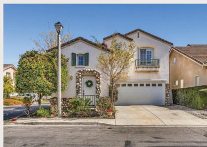
Sold | $1,065,000 (Rep Buyer)