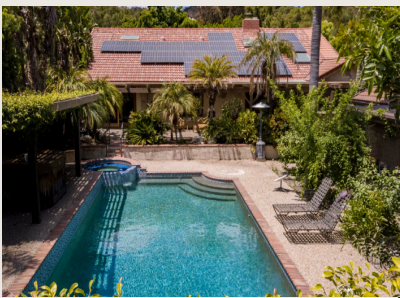
In Escrow | Offered at $1,999,900