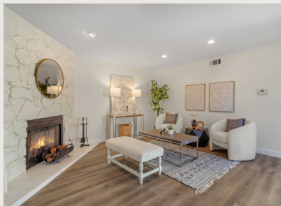
Sold | $765,000