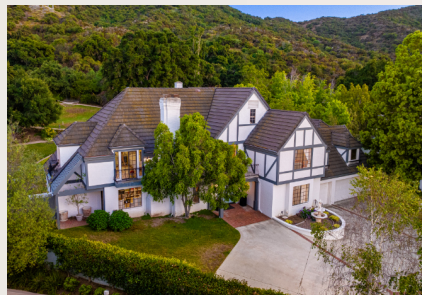
Just Sold | $2,685,000