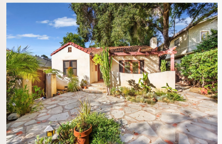
Just Sold | $1,087,500 (Rep Buyer)

Recent Activity ————— Sold: 4 ————— In Escrow: 2 ————— Coming Soon: 4-