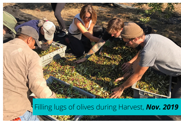
Filling lugs of olives during Harvest, Nov. 2019

Our 2019 harvest was one of the largest and tastiest we've ever had! Thanks to a fantastic crew of live-in helpers, we brought in over 10 tons of fruit. Sister Julie's Organic Extra Virgin Olive Oil is available online at shop.starcross.org as well as locally at our Honor Produce Stand. This robust oil is delicious for dipping, drizzling, and more!