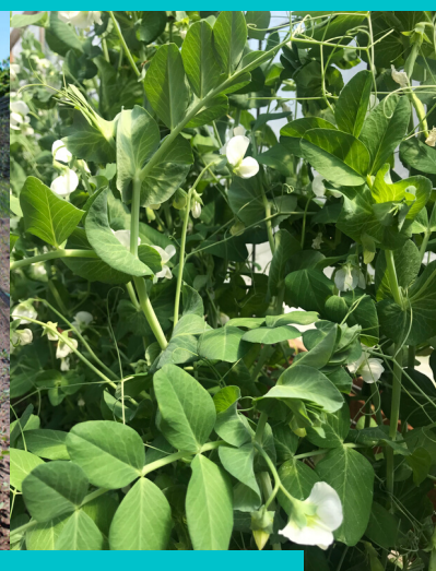
Image descriptions L to R: Cucumbers in the Garden; Lettuce in the Hoop House; Corn in the Garden; Snap peas in the Hoop House