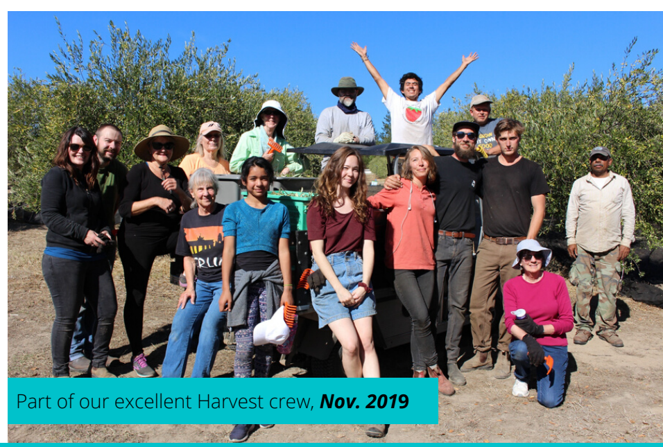
Part of our excellent Harvest crew, Nov. 2019