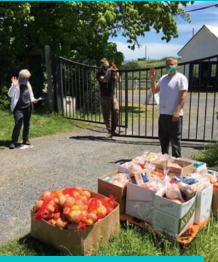
Boxes of food prepared and ready-to-go for easy and safe pick-up!

During the pandemic, the Starcross Food Pantry has been very busy. People who never expected to be in this situation find themselves jobless and unable to feed their families. As a partner agency of a large food bank in Santa Rosa, we can access government surplus food as well as buy basics at a very reasonable rate. We have set up a drive through system so that everyone stays safe. Since COVID-19 we have served approximately 550 individuals.