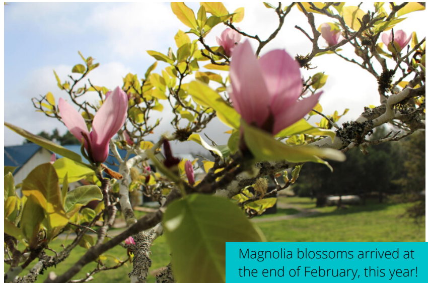
Magnolia blossoms arrived at the end of February, this year!

Is a small, independent, multi-faith community, living peaceful lives in the contemplative tradition, and offering encouragement to folks on all spiritual paths. Our emphasis is on spiritual growth, preserving the land, helping others and the world. Our organic farm is in the coastal hills of Sonoma County, CA and our 91-acre property is perpetually protected by a Conservation Easement with the Sonoma Land Trust . We've cared for children with unique gifts and needs, many of whom were born HIV positive. We've established Houses of Hope for AIDS orphans in Romania and Uganda.