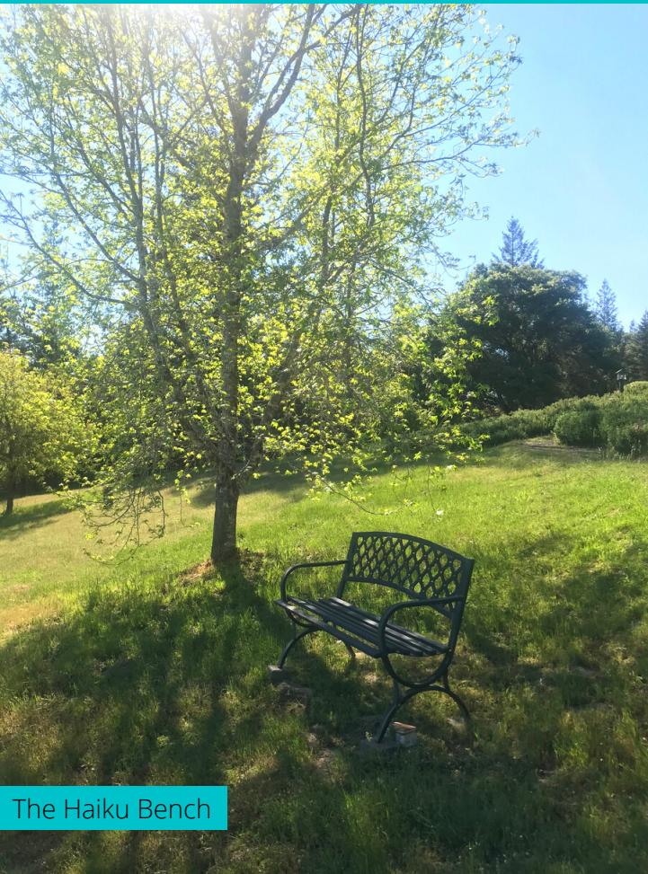
The Haiku Bench