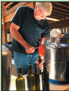
Bottling olive oil