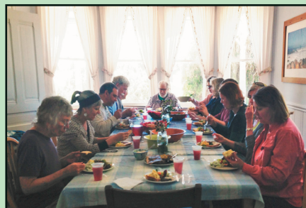
Enjoying our farm-to-table lunch!