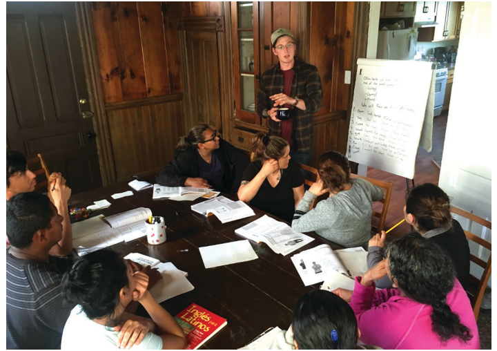
ESL Class at the Farm House