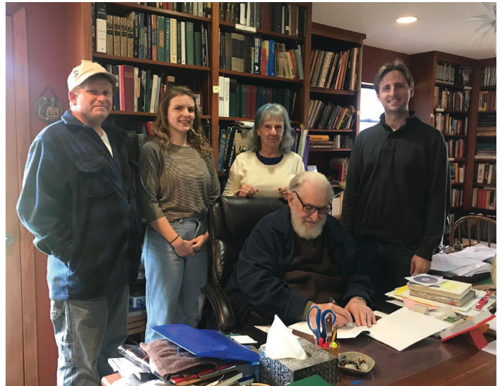
Signing the Conservation Easement