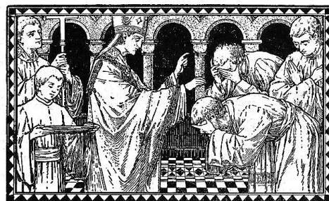
Remember, man, that thou art dust, and into dust thou shalt return

In accordance with the Church's ancient custom, the use of the organ is restricted during Lent and is employed exclusively to support and sustain the singing. Therefore, the organ prelude and postlude are omitted.