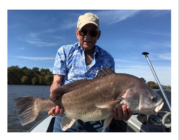
30-inch freshwater drum on a 1/4-ounce jig and worm at Crab Orchard