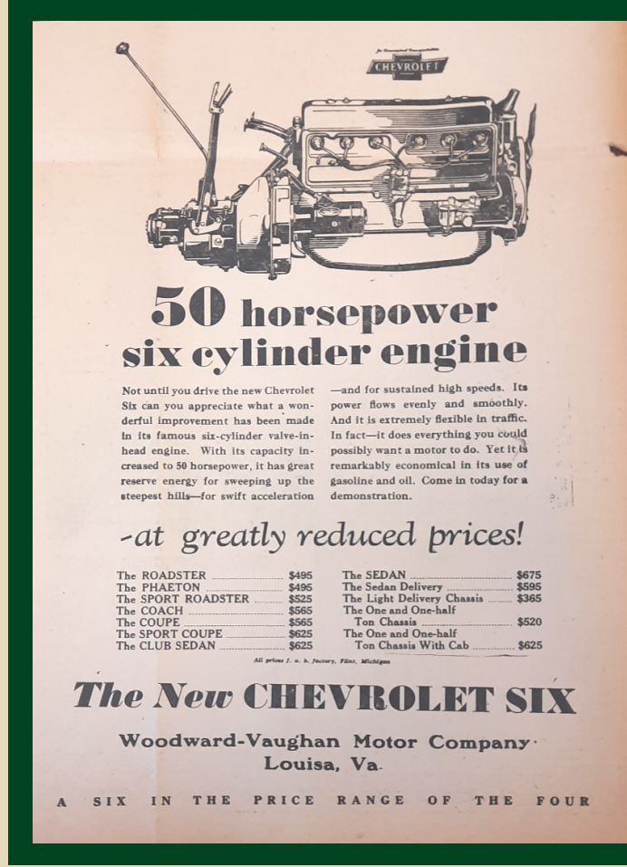
Woodward-Vaughan Motor Company. (1930, January 30). The new Chevrolet Six [Advertisement]. The Central Virginian , 2.