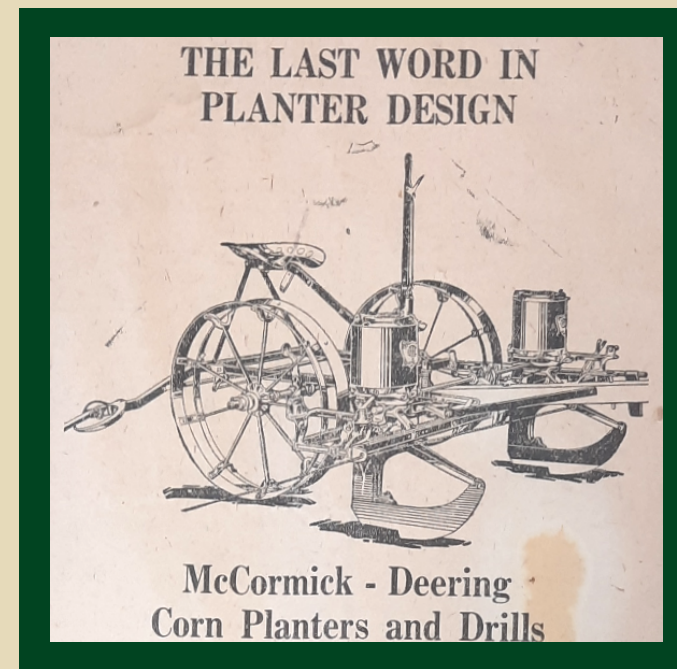
Louisa Hardware Company. (1929, April 25). The last word in planter design [Advertisement]. The Central Virginian , 3.