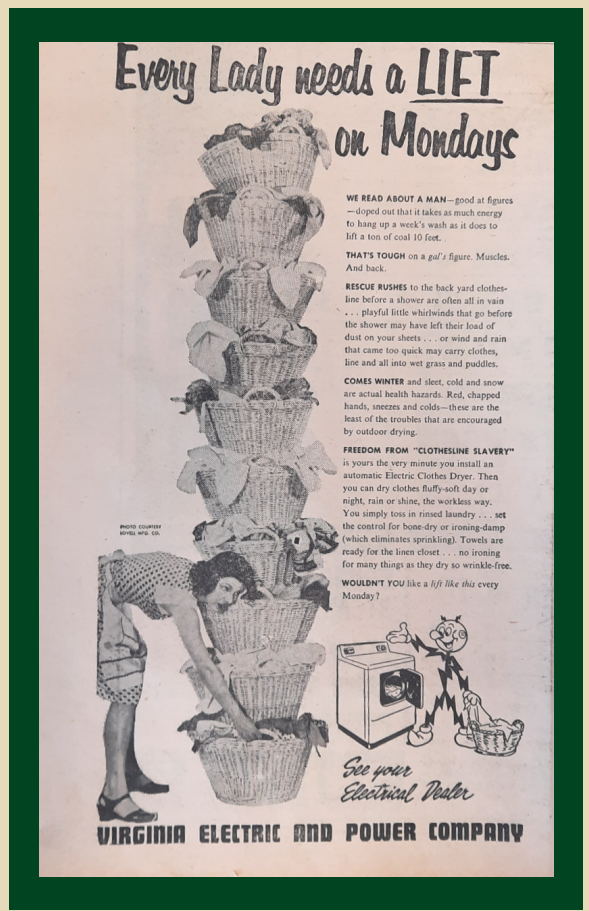
Virginia Electric and Power Company. (1957, January 3). Every lady needs a lift on Mondays [Advertisement]. The Central Virginian , 2.