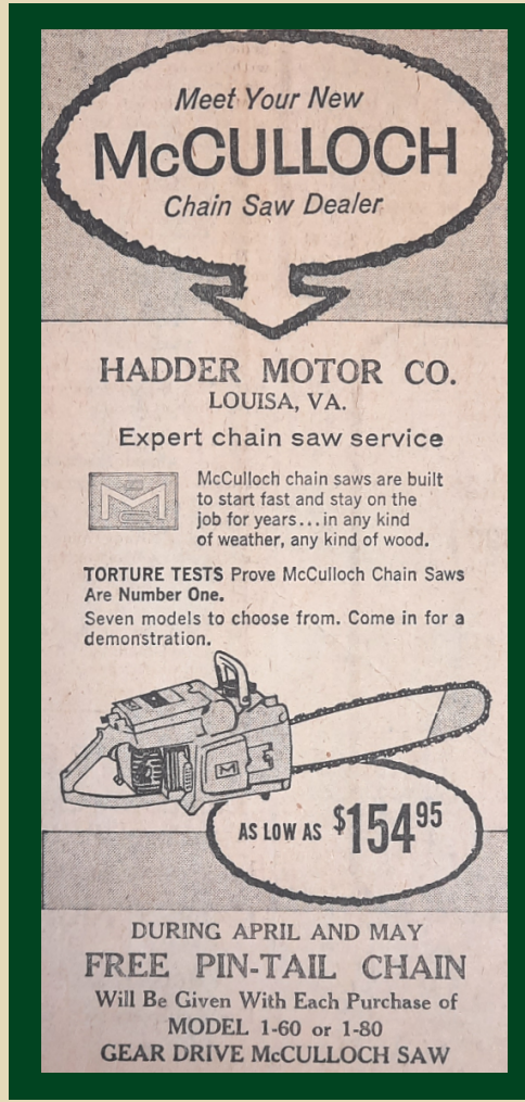
Hadder Motor Co. (1960, April 7). Meet your new McCulloch chain saw dealer [Advertisement]. The Central Virginian , 3.