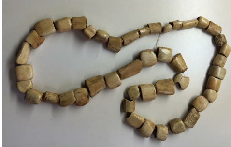
The beads of this Virginian Native American necklace are made from deer bones.

Bead jewelry is deeply rooted in Native American culture. It was often used as a means of representing social classes. It was common for Native Americans to use parts from animals to make jewelry, including bones, teeth, animal hides, and even porcupine quills. They used tendons of animals and plant fibers to string beads together. They also ground oyster and clam shells into beads. Copper was a popular metal for Native American jewelry and semi-precious and precious stones were also used including turquoise, garnets, charoite, and gaspeite stones.