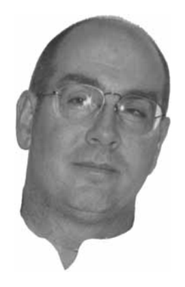
My Best Wishes Are With You All