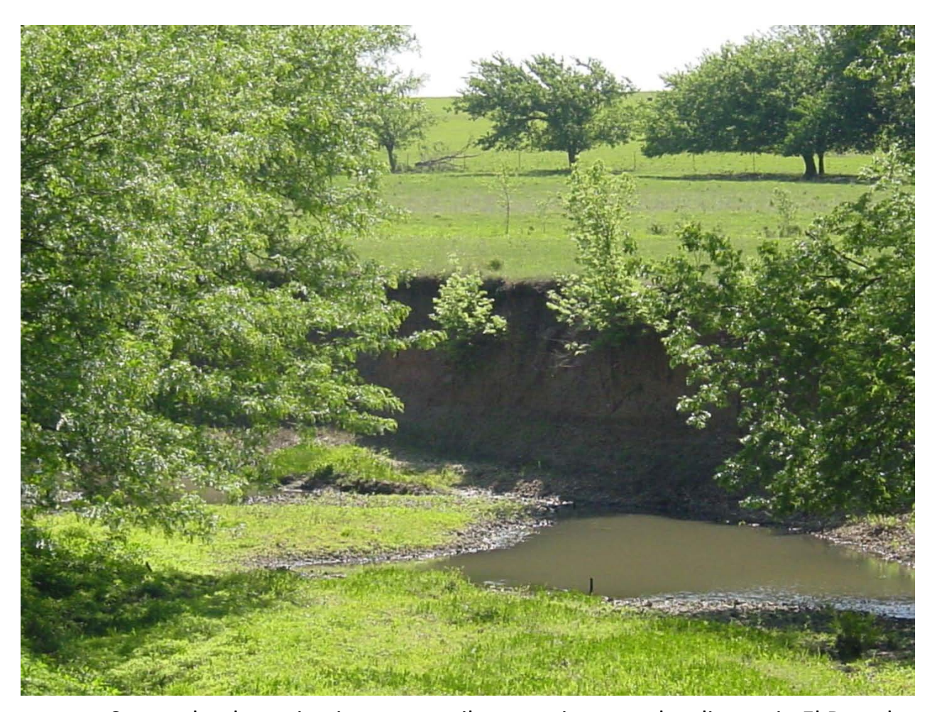
Stream bank erosion is one contributor to increased sediment in El Dorado Lake

Some sedimentation is unavoidable; however, various sedimentation studies have been completed on El Dorado Lake and they show the lake filling up with sediment before the 100 year lifespan. One study predicts at the current sedimentation rate, the lake will be full of sediment by the year 2043. For some of us, that is still in our lifetime! Other lakes in Kansas are already facing the reality of excess sedimentation.