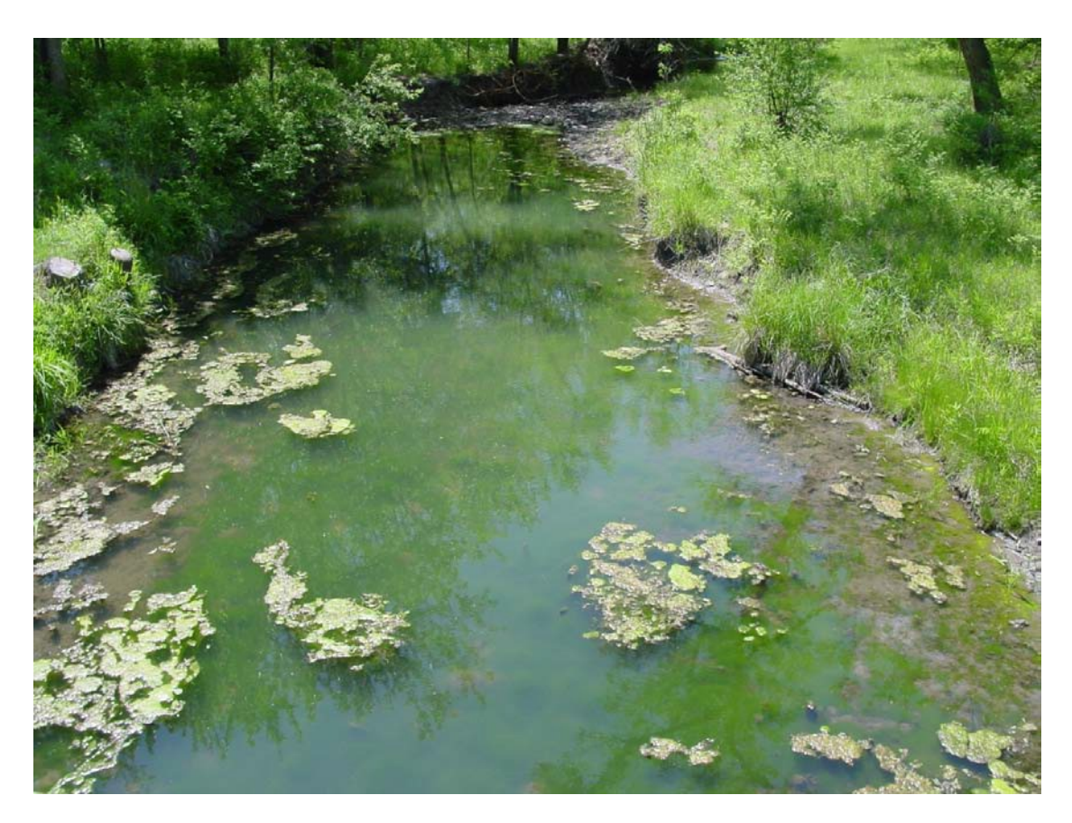
Waste from livestock or wildlife activities around streams and manure or fertilizer that enter water sources by way of runoff contribute to excess nutrients in El Dorado Lake.