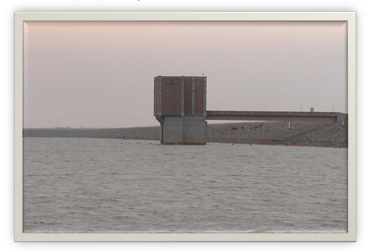
Fl Dorado Lake Intake

El Dorado Lake is one of the newer lakes in Kansas, only 35 years old, compared to Kanopolis Lake in Ellsworth County, one of the first lakes built, at 66 years old. At El Dorado Lake's conservation pool elevation of 1,339.00 feet, 8,400 acres are covered with a lake storage capacity of 50 billion gallons. The Lake has 247 square miles of drainage basin (part of the Upper Walnut Watershed), 98 miles of shoreline and 3,891 acres of state park land, making it the largest state park in Kansas. Average depth of the Lake is 19 feet with the deepest part being 63 feet.