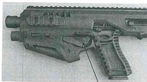
CAA RONI with safety trigger guard

I also write to warn you that ME Technology is now selling an imitation of the original Micro RONI under the name MCK. If you haven't noticed, the MCK pistol carbine conversion kit DOES NOT INCLUDE A TRIGGER GUARD . I believe ME Technology omitted the trigger guard from the MCK to avoid infringing our U.S. and European patents. However, based on my 19 years of military and Special Forces combat experience, and 15 years of design and development experience, I believe the omission of the trigger guard renders the MCK product UNSAFE AND HAZARDOUS . The trigger guard is a VITAL safety component of the authentic CAA RONI and Micro RONI and is designed to prevent an unintended discharge of the firearm while in the pistol housing. The MCK does not include this VITAL safety component. I believe the MCK design is WORSE than designing a pistol holster and leaving the trigger exposed! The omission of a trigger guard is shown in the photographs below.