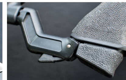
The FAB Defense GLR17 stock (above) locks into the debris channel within the grip frame. The nickel-boron-coated slide is fitted with a Trijicon RMR (left) and has layered serrations on top (below).