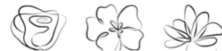
Exhibit 2 “I Wandered Lonely as a Cloud”