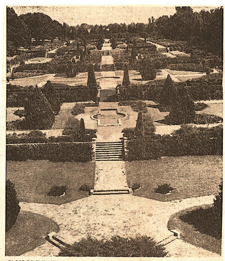
CLOSE TO THE HEARTS OF ALL—Pictured above is the Tulsa Municipal Rose Garden, the one project of the Tulsa Garden club touching the regime of each president, close to the hearts of all. Planned in 1929, it became a reality in 1933. The garden in Woodward Park is maintained by the park department and the roses are furnished by the Tulsa Garden club. The four terraces and 8,000 roses have won a national citation of honor and the garden has been selected as one of the twelve testing pardens in the United States.

The Club's focus has turned in recent years to helping restore the Garden. Charitable gifts from individuals, groups, and business donors to the Club's Rose Fund support infrastructure and soil replenishment, plus the planting of diverse varieties—instead of only roses-appropriate for our region. Restoration efforts will position the region's historic garden to rebloom and seed even more gardening education for generations to come.