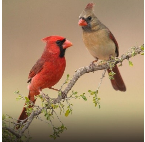
Click image for video.

Cardinals really like sunflower and safflower seeds. Remember, most young birds, including cardinal babies feed on caterpillars. The nestlings leave the nest 9-11 days after hatching.