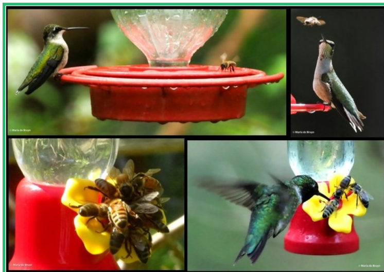
Top left and right: ruby-throated hummingbird keeping an eye on a bee. Bottom left: bees are very attracted to yellow color and sugar water. Bottom right: sometimes a hummer will “brave the bees” to get a drink.

A successful method I use came from comments in 2023 from a private Facebook group, “Oklahoma Hummingbird Watchers.” Soak bread in a pan of sugar