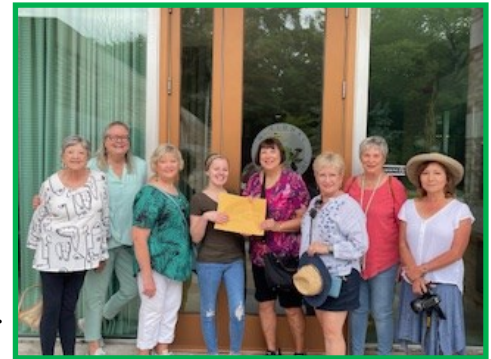
May 23, 2024 "St. Louie Seven" toured NGC headquarters, pictured presenting the Club's Penny Pines contribution for Ouachita National Forest. See page 6 for Penny Pine recipients honored on June 3!