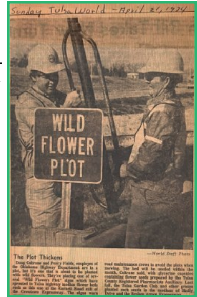
The Plot Thickens Two Calhoun and Perry fields, employees of the Oklahoma Highway Department are in a field, but it's not that it is about to be planted with wild flowers. They're standing out of actual "Wild Flower Plot" signs which have appeared in Tulsa highway median flower beds such as the one at the bottom. Seed still of the Oklahoma Highway. The signs were read maintenance crews to avoid the plots when mowing. The bed will be seeded within the month. Calhoun said, with glycyrrhiza capsules containing flower seeds prepared by the Tulsa County Registered Professional Auxiliary, Last fall, the Tulsa Garden Club and other groups planted such seeds in the medians of Shady Grove and the Broken Arrow Expressway.

Wild Flower Plot signs were placed in highway medians and city flower beds.