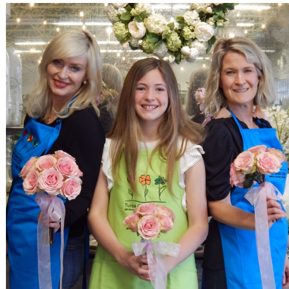
Bouquets and venue courtesy Toni's Flowers & Gifts