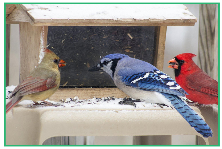
Click image, above, to BirdAdvisors.com printable worksheets.

Bottom line? Along with winter seed mixes, plan to incorporate into your green spaces native berry-producing evergreens and shrubs for birds' food and habitat. Leave seed heads to snack on in the dead of winter. Birds will "pollinate" freely in your 'hood.