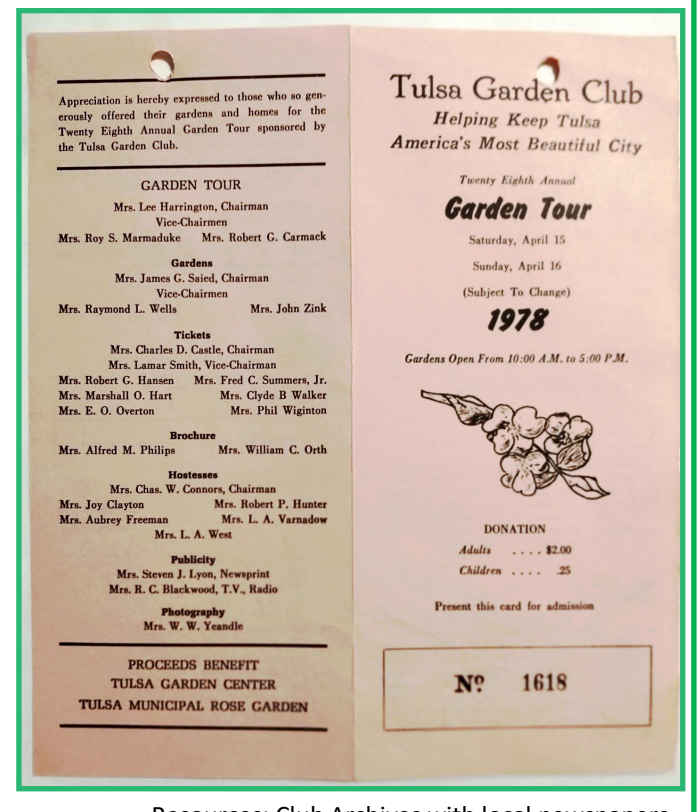
Resources: Club Archives with local newspapers.

With four gardens and three interiors, we must recruit 75 Volunteers for this 74th Annual Garden Tour. Be THE Tour "Heart & Soil" as a Cashier, Host or Hostess. Recruit family and friends! Each non-Member Host or Hostess gets a complimentary ticket to enjoy the Tour. Sign up , TODAY!