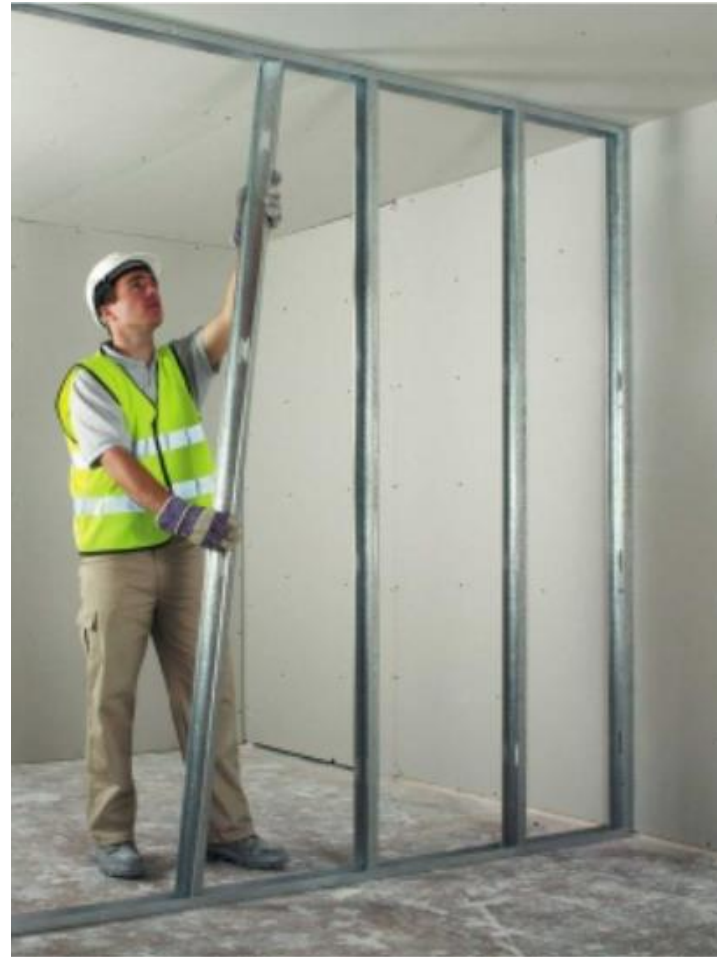
70mm C stud British Gypsum