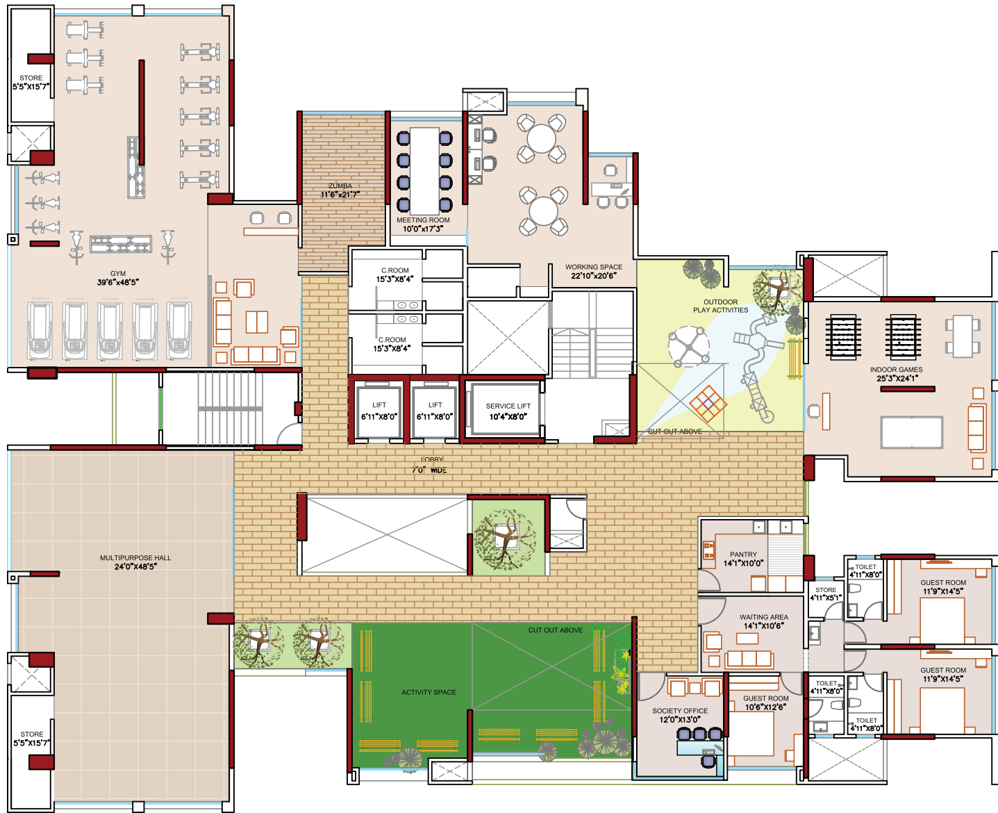
AMENITY FLOOR PLAN