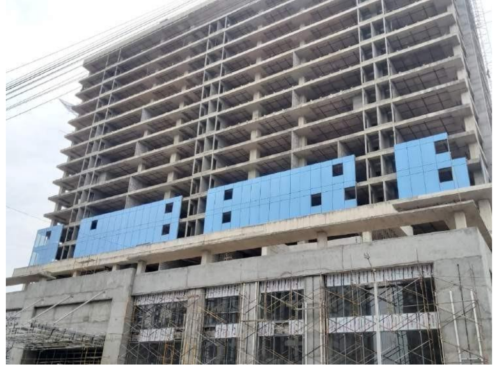
Under construction photos