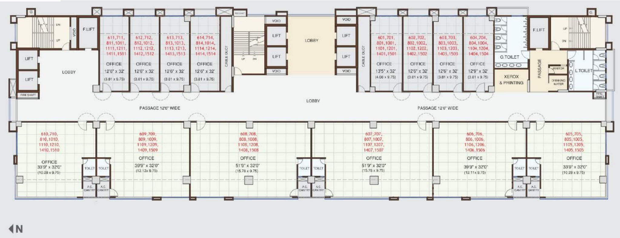
Typical Office Floor Plan