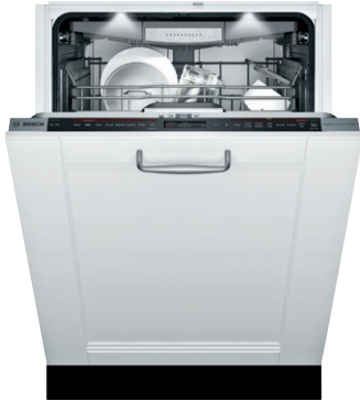
SHV89PW73N Custom Panel

39 dBA: The quietest custom panel dishwasher Bosch offers, the near silent operation provides the ultimate peace in your kitchen.