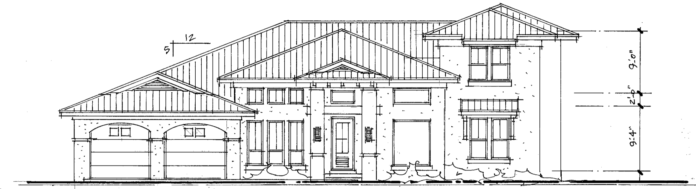
CONCEPTUAL FRONT ELEVATION