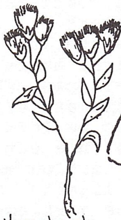
Horsebrush contains a liver/kidney poison causing photosensitivity in light colored skin