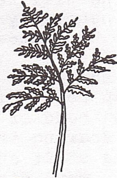
Bracken poisoning occurs over time causing weight loss, staggers