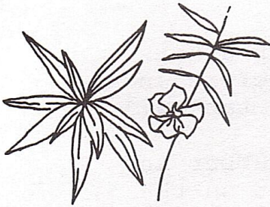
Oleander poisoning causes diarrhea, abnormal pulse, chill