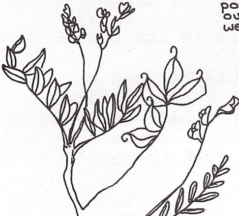
Loco weeds cause staggers, convulsions