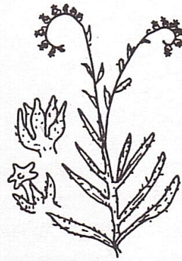
Tarweed poisoning causes liver dysfunction