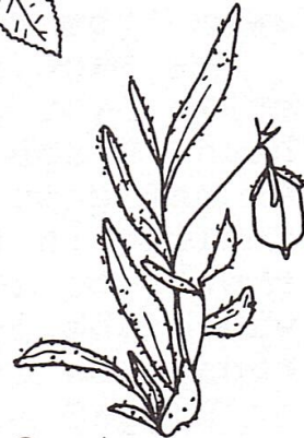
Rattle box poisoning causes drooling, bloody feces, stupor