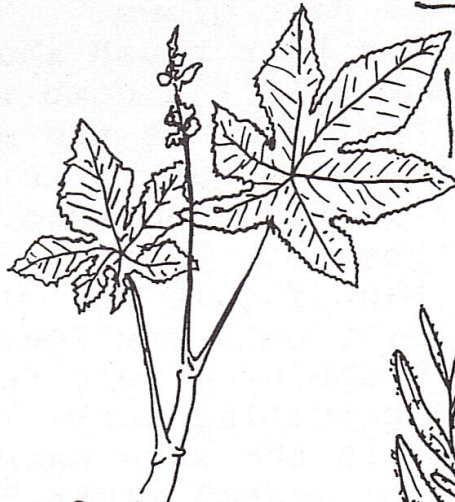
Castor bean seeds are highly toxic