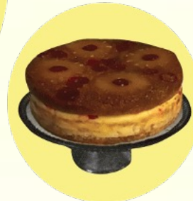
Pineapple Upside Down