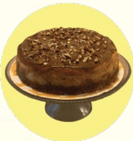
Caramel Pecan Delight