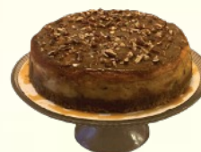
Caramel Pecan Delight