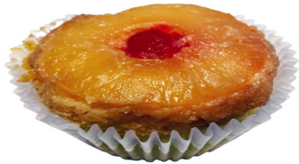
Pineapple Upside Down