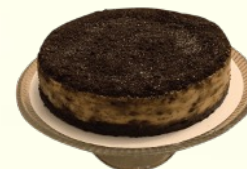
Chocolate/Banana w/Oreo Cookie Crust