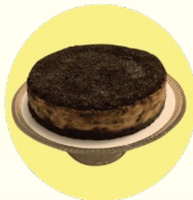
Chocolate/Banana w/Oreo Cookie Crust