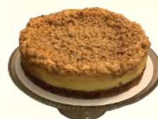
Apple Cinnamon Crunch