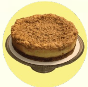
Apple Cinnamon Crunch