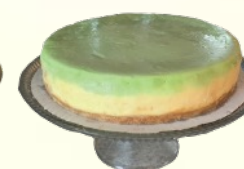
Key Lime Crème Supreme