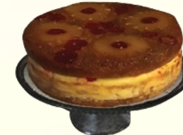
Pineapple Upside Down