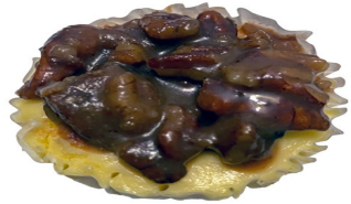
Caramel Pecan Delight