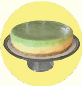
Key Lime Crème Supreme