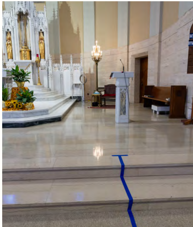
Pictured: Location of proposed handrail between the main floor to the sanctuary, ceiling damage, and loose roof tiles.