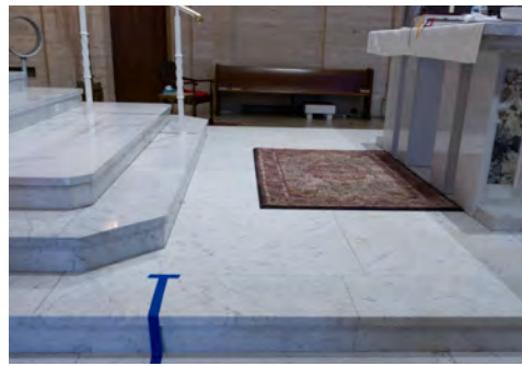
Installation of two handrails between the main floor of church to the sanctuary, and a handrail from the lower sanctuary level to the altar level to increase accessibility. (Estimated cost = $3,800)