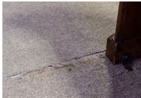
Re-carpeting the church. The carpeting is over 30 years old and is badly in need of replacement. (Estimated cost = $45,700)

There is no shortage of projects to which we can apply these funds. In fact, the needed repairs and maintenance around our campus could easily double that amount. Therefore, to show our great gratitude for this most generous gift, we are launching an initiative to raise another $100,000 from parishioner donations to repair, renew, and refresh our campus.