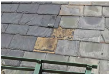
Exterior repairs to the church and rectory roofs, and internal repairs from water damage. (Estimated cost = $76,775)

These funds will enable us to continue the mission of St. Gertrude by maintaining our buildings and supporting Catholic education. The much-needed repairs include: